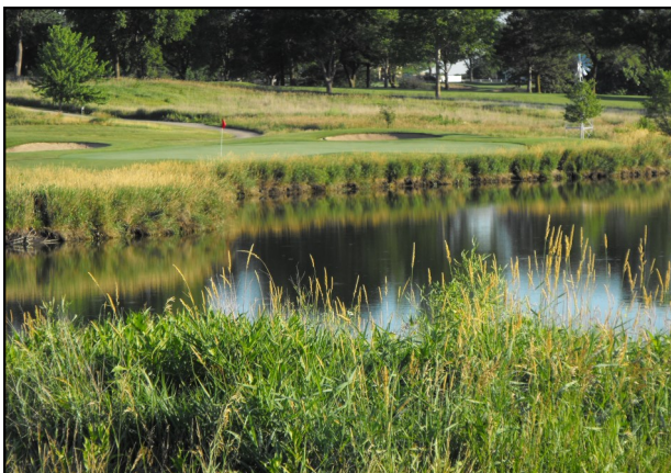
Beatrice Country Club, NE